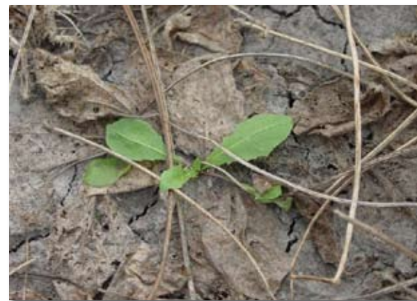
Seedling dandelion in a field.

The focus for producers and crop consultants should be to develop weed control plans that utilize multiple modes of action and proper herbicide application timing to combat weed resistance. In the past few years, when crop prices were on the down side, some producers were trying to keep costs as low as possible sometimes utilizing only glyphosate as the complete herbicide program. With rising crop prices and the realization of more weed resistance development, it is time again to look at more comprehensive weed control plans utilizing multiple modes of action herbicides. This usually means utilizing residual herbicides to help reduce the bank of seed accumulation and to provide a second or third mode of action to attack the weed. Developing a weed control plan is a farm specific and often field specific process. The producer and agronomist should detail the plan of attack to delay glyphosate resistance as long as possible, and to help preserve glyphosate as an effective weapon in our herbicide arsenal.