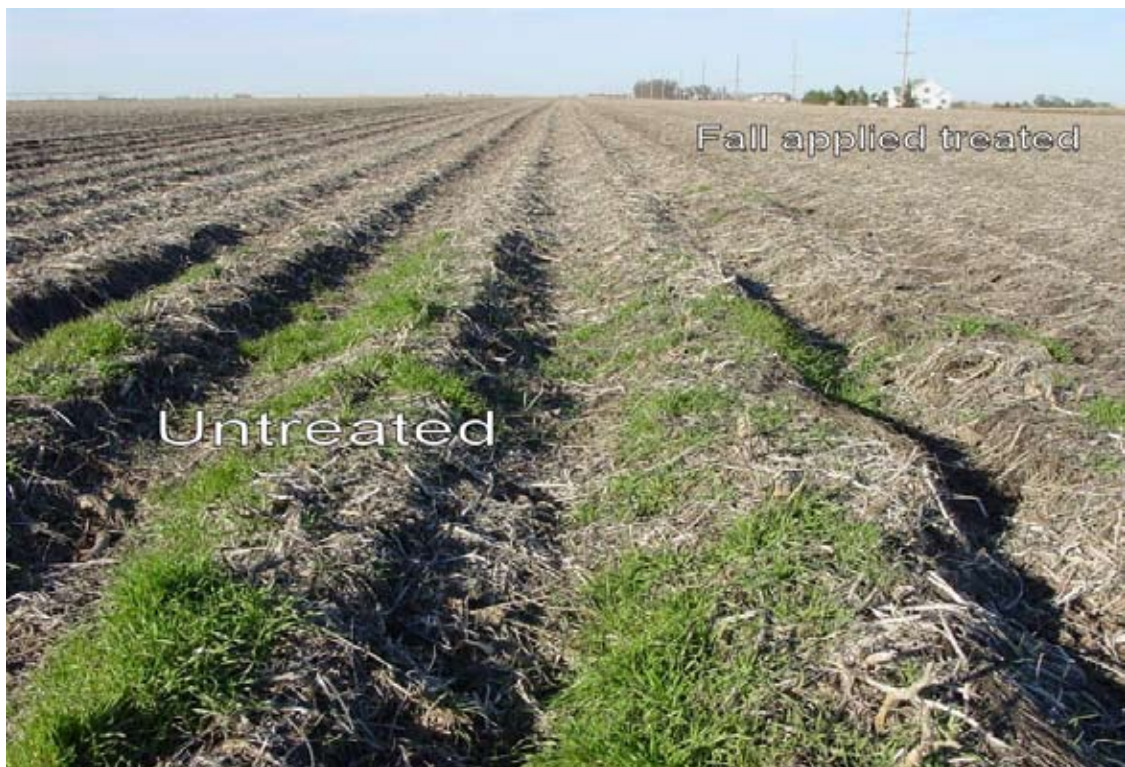
Untreated and fall applied herbicide.